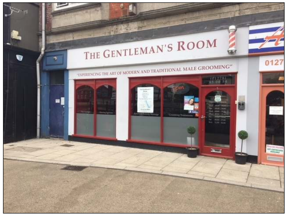
Unit 1 Fishermans Wharf, Bridgwater, Somerset, TA6 3HL.